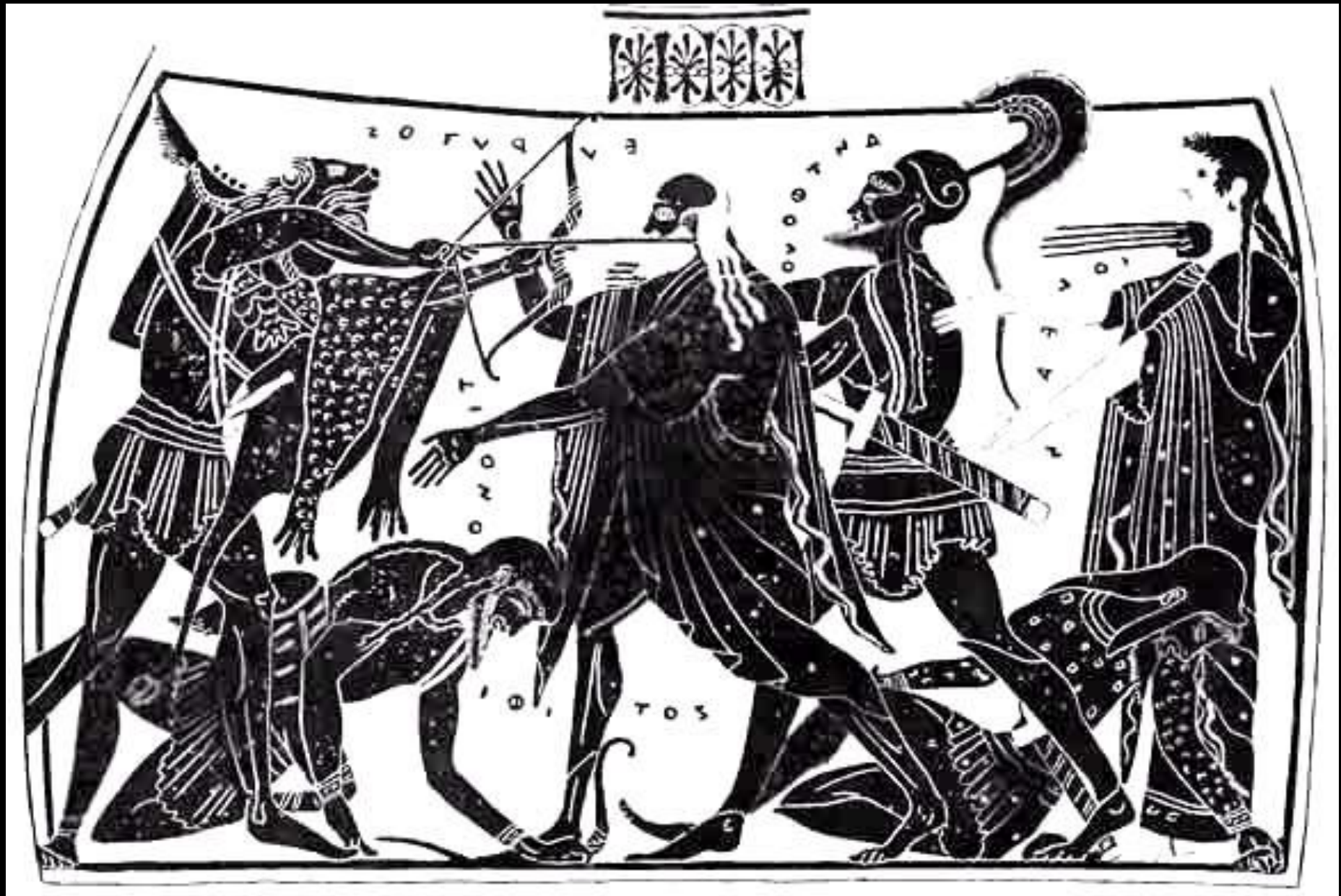
Heracles competes against Eurytos and sons for Iole. Drawing from Attic black-figure vase c.500 BC (Madrid).