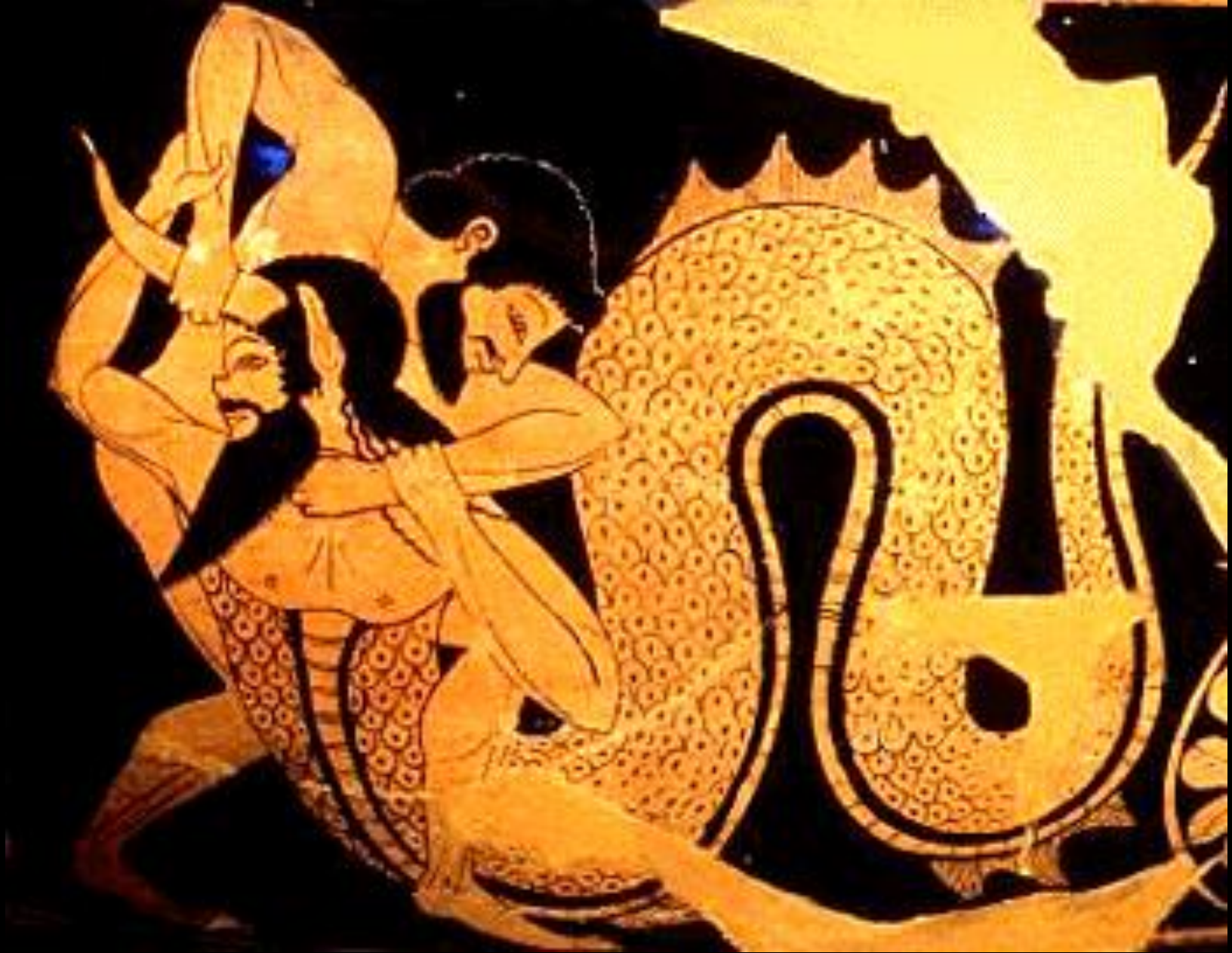
Heracles fights the river-god Acheloos. Attic red-figure vase, c.500 BC (London).